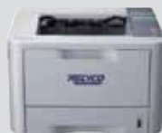
Mono Laser MICR Check Printer