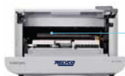
Single Cartridge Toner